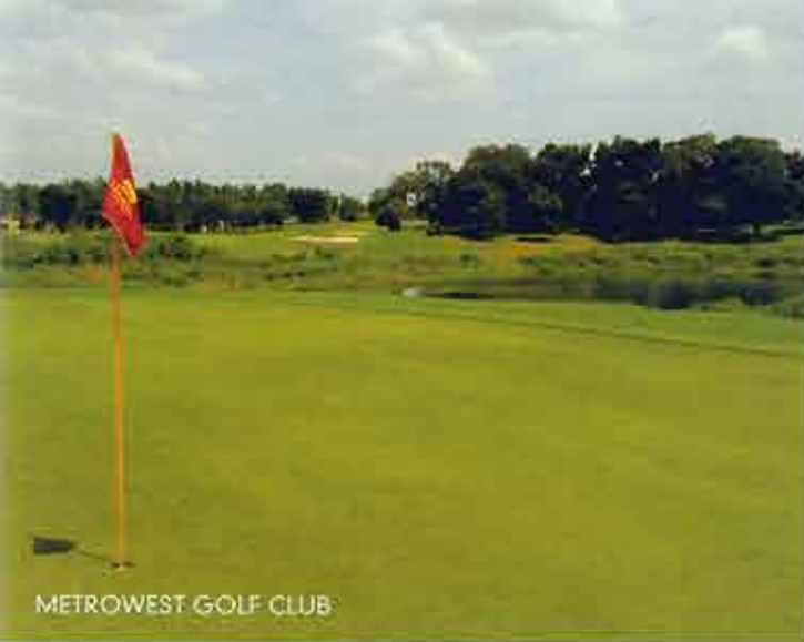
METROWEST GOLF CLUB