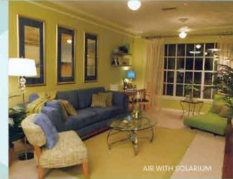
AIR WITH SOLARIUM

All measurements approximate and subject to change.